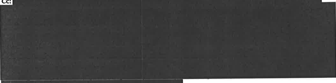
Subject: Stop School Districts Unlawful Policy (GBAPS)